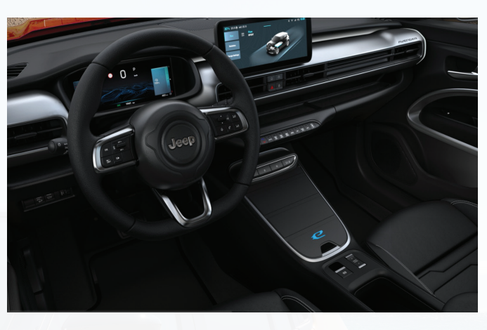
Black Leather Trimmed Bucket Seats ALX9 - Standard